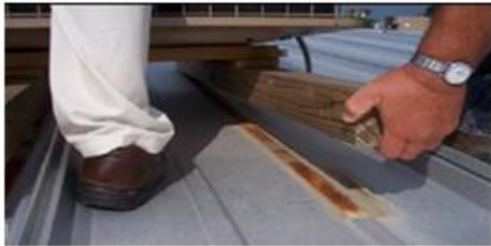
Figure 3. Roof corrosion from treated wood

materials get wet, these corrosives become water-borne, can dissolve, and attack the anodic metal roofing material. These effects are intensified because lumber is porous and traps moisture against the metal which accelerates corrosion. (See Figure 3.) Preservative-treated lumber and like products should not be used on metal roofs. Even untreated lumber and rubber pads pose a risk of moisture entrapment. If the use of treated or untreated lumber or rubber pads cannot be avoided suitable stainless steel grades can be used (304 or 316L depending on location).