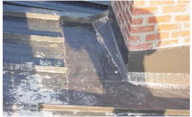
Figure 4. Cement, mortar, and related products can damage metal roofs

Construction trades should be sequenced so that adjacent masonry work is complete before roof materials are put in place. If this is not possible, the roof surface must be thoroughly protected. If a spill of alkalis occurs, it must be immediately removed and thoroughly cleaned and rinsed with clean water to prevent damage. Be aware most masonry cleaners contain hydrochloric acid which will affect most metals. Stainless steel 316L will be the most resistant to those types of cleaners.