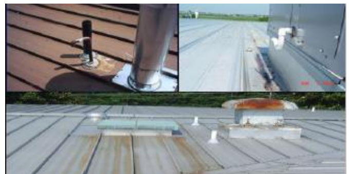
Figure 2. The harmful effects of copper runoff